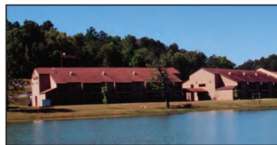
C.A. Vines 4-H Center

I have had the privilege to be the Executive Director of the Arkansas 4-H Foundation for the past two years. The Arkansas 4-H Foundation is what makes Arkansas better. The C.A. Vines Arkansas 4-H Center in Ferndale, west of Little Rock, is the nation’s premier 4-H conference center. The center will soon be celebrating its 30th year anniversary. The multi-million dollar facility was provided by and for loyal 4-H members, 4-H alumni, 4-H parents, 4-H leaders, and 4-H donors. The 4-H Center has grown dramatically over the years, thanks to the loyal supporters such as you. I would like to thank you for your support of the Arkansas 4-H Foundation to make the C.A. Vines Arkansas 4-H Center a reality.